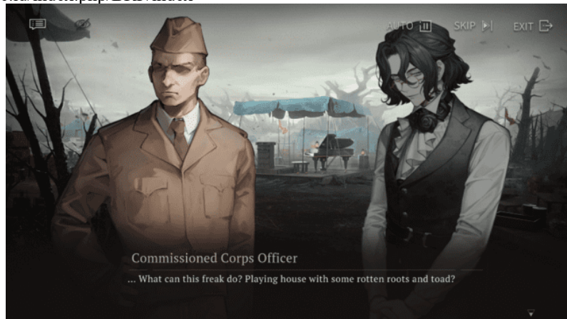
Figure 3 Corps and Forget Me Not