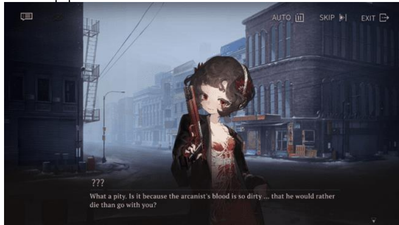
Figure 2 Schneider's dialog