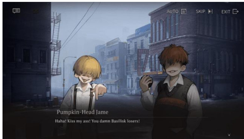
Figure 1 Pumpkin Head Jame bullying Vertin