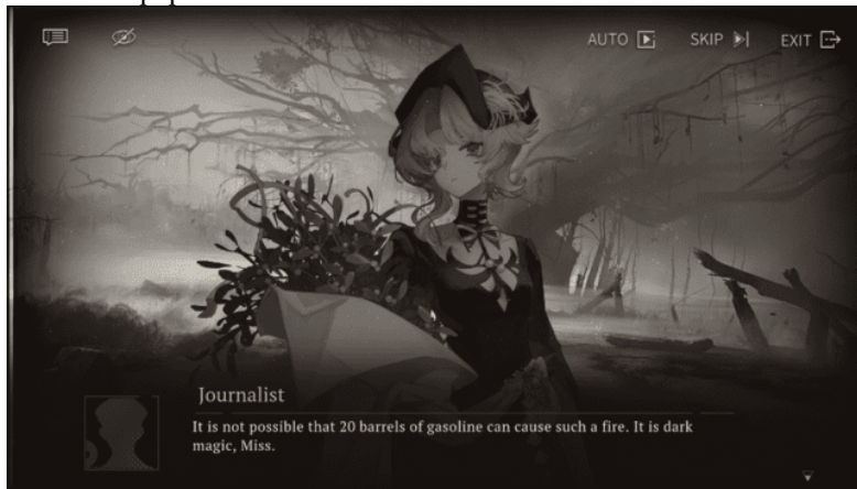
Figure 5 Druvis and Journalist dialog