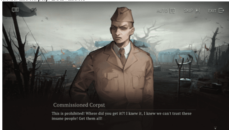
Figure 4 Corps upset over a legal violation