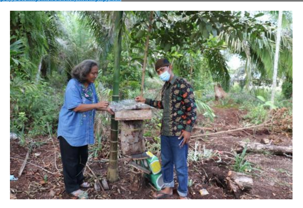
Figure 2 Kelulut honey farmer

Other farmers who are also involved in the kelulut honey cultivation program, also said that the RE BRG honey program has a fairly high sustainability aspect for the community.