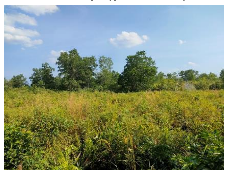
Figure 6 An abandoned pineapple farm

The sustainability of the pineapple cultivation program in Mundam Village was also not found. This can be seen from the team's observations in the field and interviews with non-BRG farmers. He said that the RE BRG program only runs for the first year, the next year its seems that it will no longer run if there is no new budget that is dropped (Interview with respondent 4). Pineapple plantations, as seen in the photo below, only see shrubs that are very vulnerable to land fires, while the pineapple trees are no longer maintained.