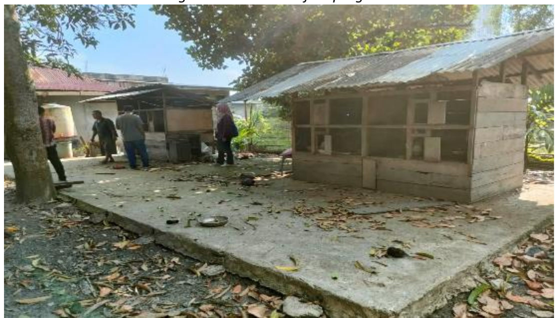
Figure 5 Chicken farm in Teluk Makmur Village, Medang Kampai, Dumai