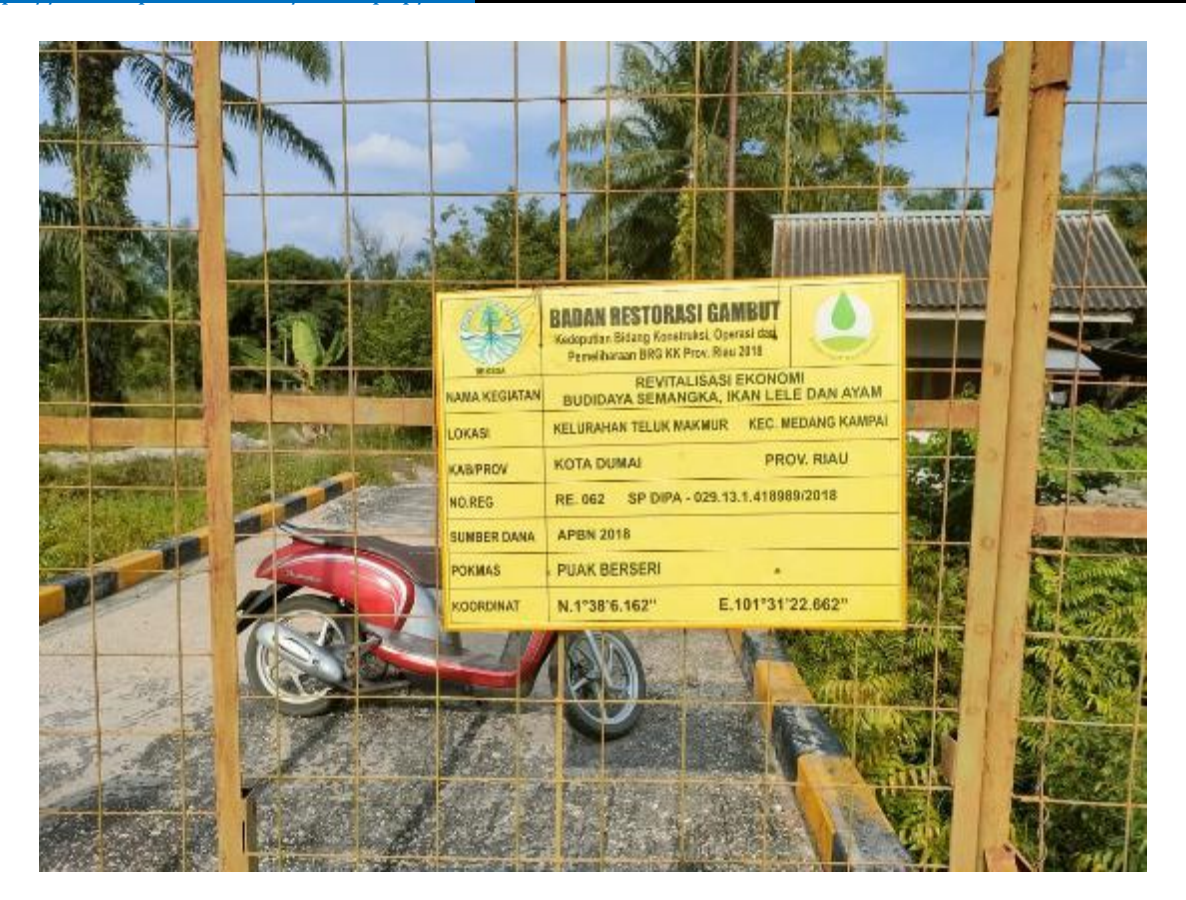
Figure 4 Front view of BR program