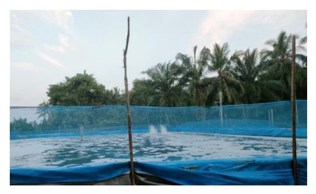
Figure 3 Shrimp cultivation program

Field observations and interviews with several informants regarding the sustainability aspects of the catfish farming RE program in Teluk Makmur Village can be said to have failed. The Pokmas Lele program took place around 2017-2018. What remains is only the former catfish breeding grounds in the form of land seminization behind an informant's house. The informant also said that in his village there was also an RE program for chicken farming, which also failed and the program did not continue.