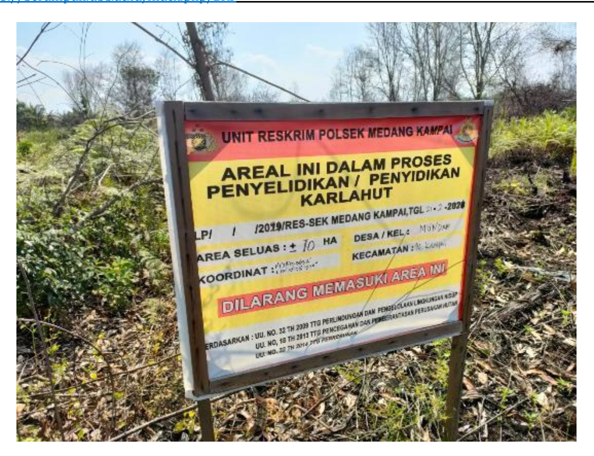
Figure 8 2020 forest fire area around the RE BRG program pineapple plantation