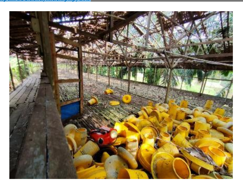
Figure 7 An abandoned chicken farm

The Effectiveness and Efficiency of the RE BRG Program on Forest Fire Prevention The The issue that is also a concern in this study of the RE BRG Program is how the effectiveness and efficiency of the RE program on forest fire prevention is. From some of the answers obtained, it can be emphasized that this is very dependent on the sustainability of the program or the success or failure of the program being implemented. As stated by one of the informants, if the program and its budget do not continue or the program fails and is stopped, then the chance of a fire is still high (Interview with respondent 4). The forest fires that occurred in 2020 still occurred not far from the BRG pineapple plantation RE program where there was about 10 ha of burned land. This proves that the effectiveness and efficiency of the RE BRG Program can still be said to be the lowest.