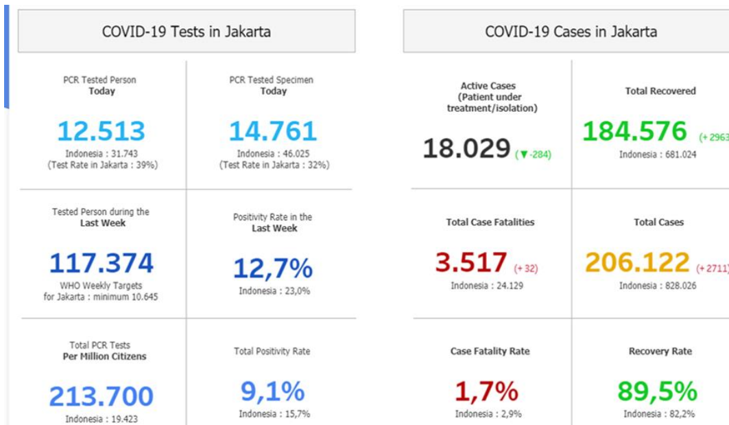
Picture 1. COVID-19 Situation in Jakarta per 10 January 2021 (Pemprov DKI, 2020)

The number of total confirmed and active cases in Jakarta reached up to 206,122 and 18,029 respectively per 10 January 2021 (Pemprov DKI, 2020). The figure put the region as one of the regions with the highest number in term of both confirmed and active cases among other counterpart regions in Indonesia. The figure was followed by a high weekly positivity rate of 12.7 percents (Pemprov DKI, 2020). However, its total positivity rate was 9.1 percents meaning that it was still below ten percents categorized 'good' by the WHO. At the press conference on the COVID-19 situation update in Jakarta held on 9 January 2021, Governor Anies Baswedan revealed that there was a trend of positivity rate increase in the city following public holidays since August 2020 and the latest were Christmas and New Year holiday (Baswedan, 2021a).