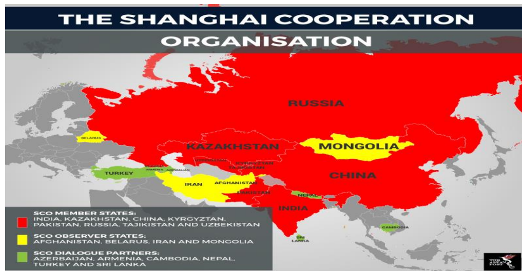
Map 1: the SCO map (Shanghai Cooperation Organization, 2020)

The establishment of “Shanghai Five” in 1996, was an effective move on border issues between the Central Asian republics of Kazakhstan, Kyrgyzstan, Tajikistan, Russia and China, then when Uzbekistan joined them in 2001, it was renamed as “The Shanghai Cooperation Organization”. The organization is a Eurasian political, economic and security alliance, consisting of China, Russia Kazakhstan, Kyrgyzstan, Tajikistan; and Uzbekistan. India and Pakistan gained accession in June 2017 and there are numerous observer states including the likes of Iran, Afghanistan, Belarus and Mongolia (see the bellow map) 1 . In terms of geographic area and population, it makes the organization one of the largest in the world, and one of the most powerful. By now, its members cover 60% of the Eurasian continent, the eight SCO members have a population of half of the world population, and a GDP of nearly 20% of the world total. (Shanghai Cooperation Organization, 2020) (see also table 1).