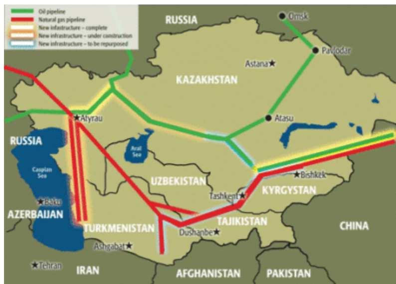
Map 2:SCO members' oil and gas pipelines to China 7

The Kazakhstan-China pipeline, which has a final capacity of 200,000 barrels of oil per day, is a symbol of China's influence in Central Asian energy resources. In addition, China reached an agreement with Turkmenistan on the gas pipeline in 2009, achieving an annual capacity of 30 billion cubic meters of Turkmen gas to China. Meanwhile, China is negotiating with Kazakhstan to buy the country's gas through the construction of a new pipeline that starts in Ishim, reaches Astana, and finally reaches Alashanko on the Chinese-Kazakh border. China National Petroleum Corporation has